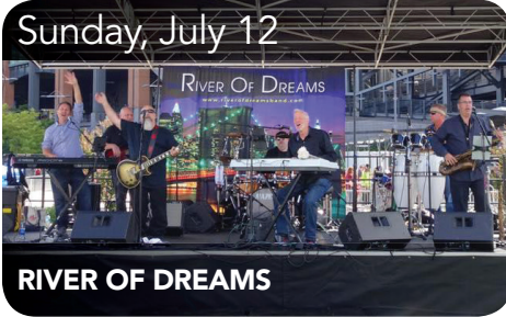
RIVER OF DREAMS