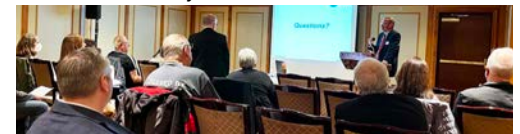
TTD ANNUAL RATEPAYER MEETING AT THE NORWALK INN & CONFERENCE CENTER

Our annual district ratepayer meeting was held on March 2, 2022. Our budget was passed. Thank you to all who attended!