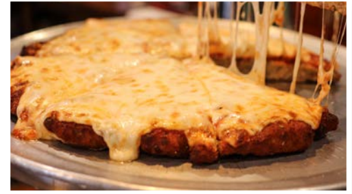
CHICKEN PARMIGIANA PIZZA, A LOCAL FAVORITE; BJ RYAN'S IS ALSO KEEPING THE ORIGINAL "PARTNER'S SPINNER" THIN CRUST PIZZA!