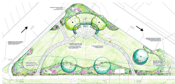
Architect's rendering of the Roger Ludlow Park Site Master Plan