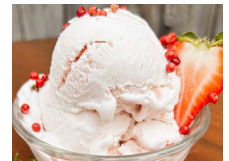
Lindsay Arakelian and some of Lindsay's unique handmade ice cream creations!